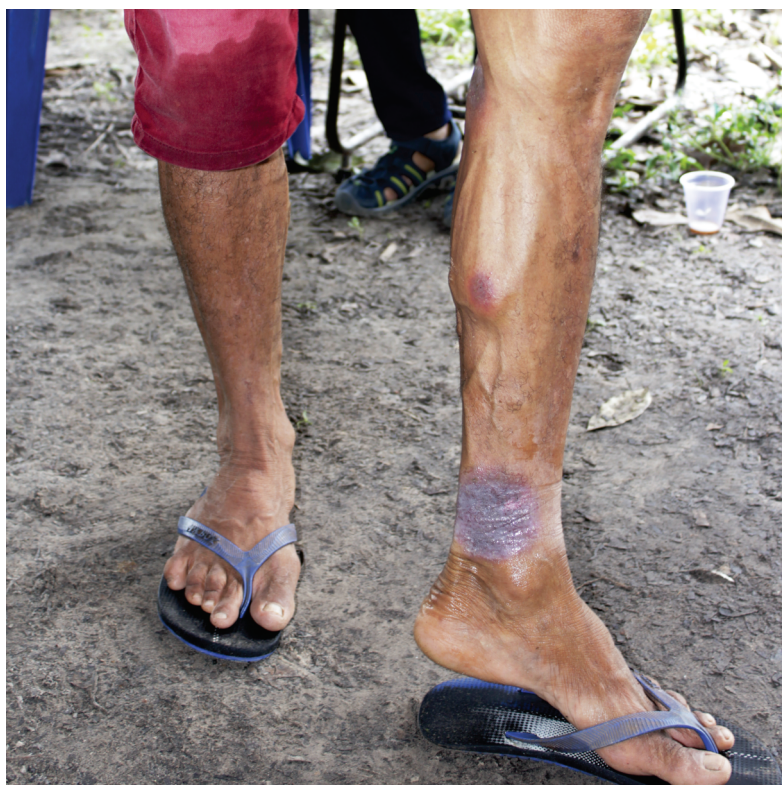
Figure 4 - Rural worker exposes several injuries on his body, which appeared after contact with pesticides.