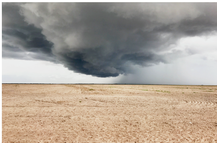
Figure 2 – Deforestation of the cerrado for soybean plantation, in Buriti/MA